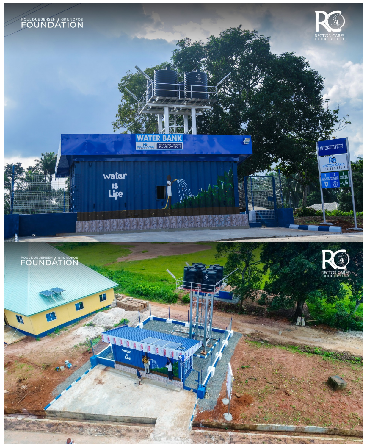
Population: 17,250 People Liters: 10,000 Liters Per day Drilled: 280 FT to get clean Water